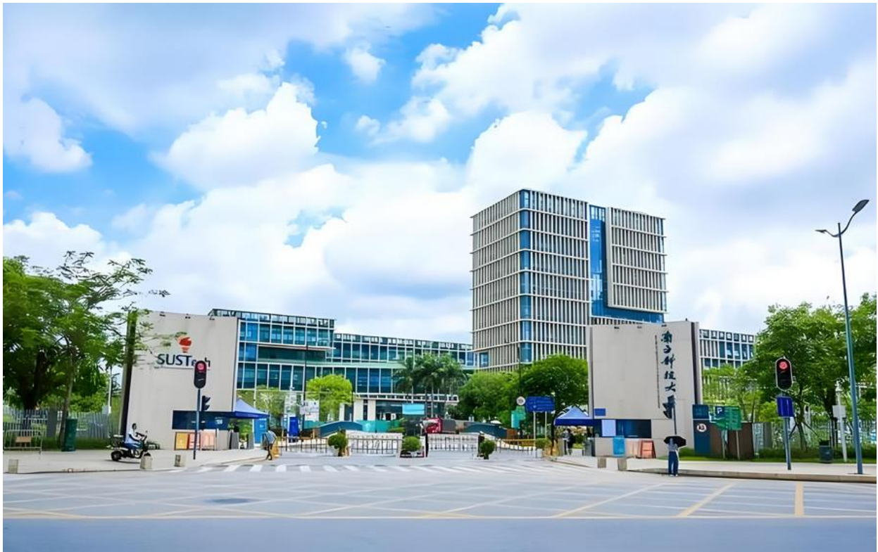
Main gate of SUSTech

Note: Please wear your MSAM 2025 conference badge.