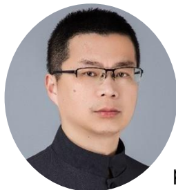
Yuanqing Li Professor, Chong University, China

aspects: the prediction of buckling failure and the design of strengthening and toughening of curved thin-walled structures, the cross-scale construction of flat composite laminates and the constitutive model of composite materials, and the microscopic mechanism of nanoscale surface and interface forces and high-speed collision/penetration.